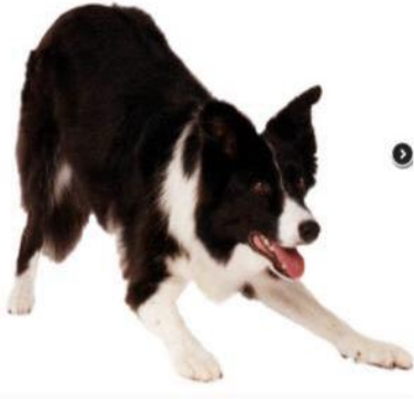
PLAYFUL POSE Bowling Down