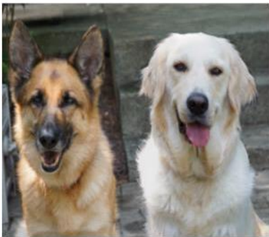
HAPPY DOG Ears up Soft eyes Mouth open Posture