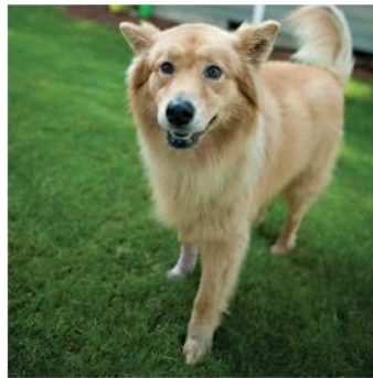
WARNING SIGNS BEFORE BITE Standing one foot forward Ears back Tail straight Eyes hard Mouth clinched