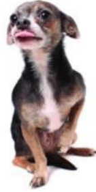
WARNING SIGNS BEFORE A BITE Ears back Nose licking Hard stare Leg up